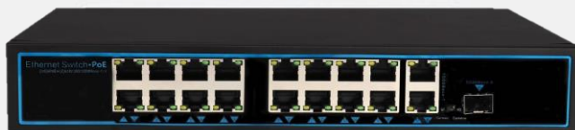
Upper layer switch