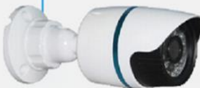
POE Camera (POE module inside)